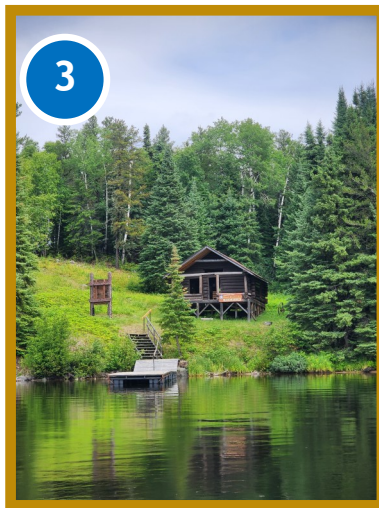
West Red Lake Mining Museum